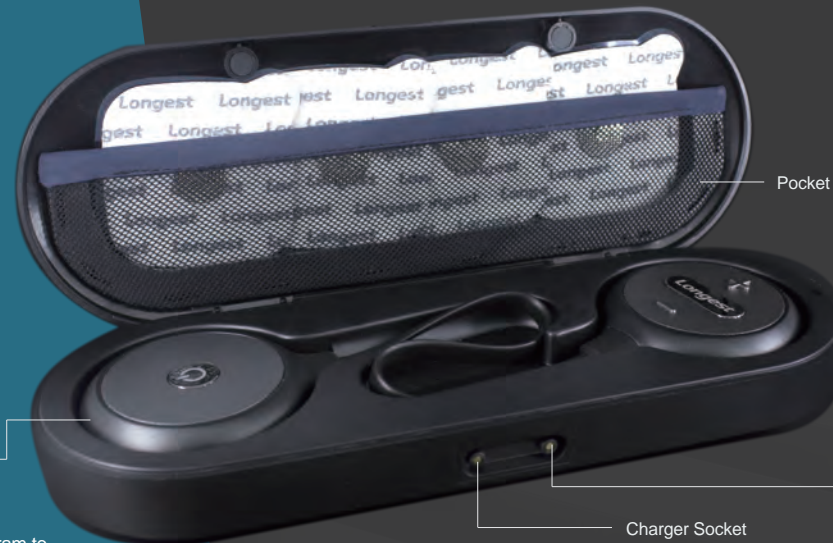
Pocket for electrodes